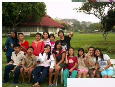
The new sala at the church of Napajat. (A sala is a building with a roof but with no walls.)