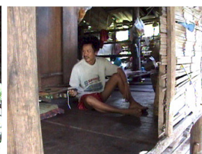
Awm's paralysed uncle