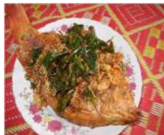
A delicious fish made for us by one of the fathers to an AIDS Care child.