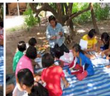
Everybody participate in the small groups with enthusiasm and joy.