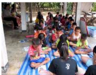
To see a 15 year old girl pray together with 39 children and read bible stories for them were very impressive and moving.