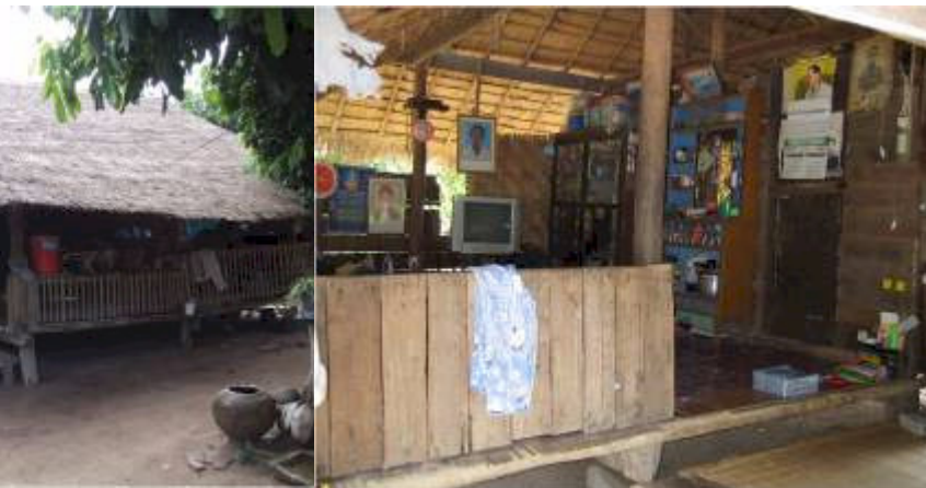
A poor home for one of AIDS Care's children in Doi Law. The father has died of AIDS and the mother is struggling to survive. The support from AIDS Care to the child's schooling is important. The roof on the house is leaking when it rains. It should be renewed - but there are no money left to do it.