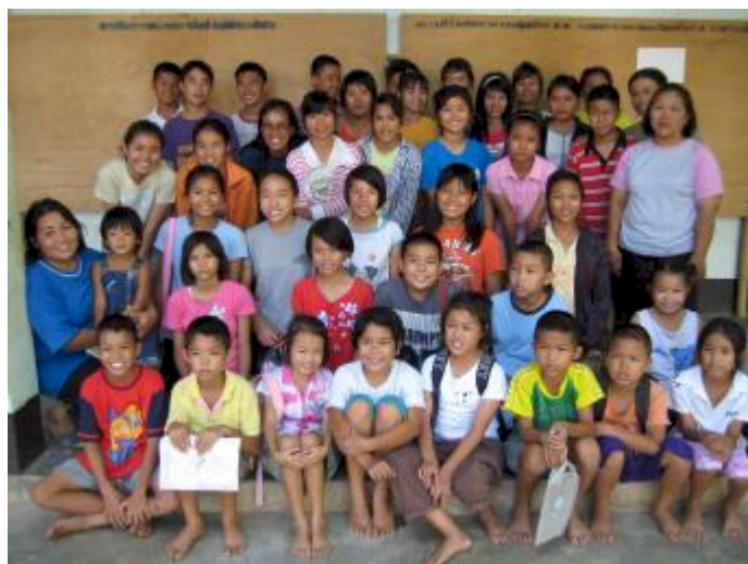
Children and workers in Doi Law.

A fight and battle for the rejected, for the poor - for the AIDS victims. ■