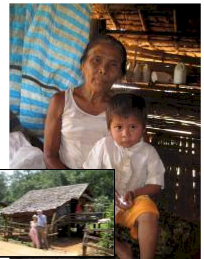
A poor grandmother with her AIDS-sick grandchild in Mae Hong Son