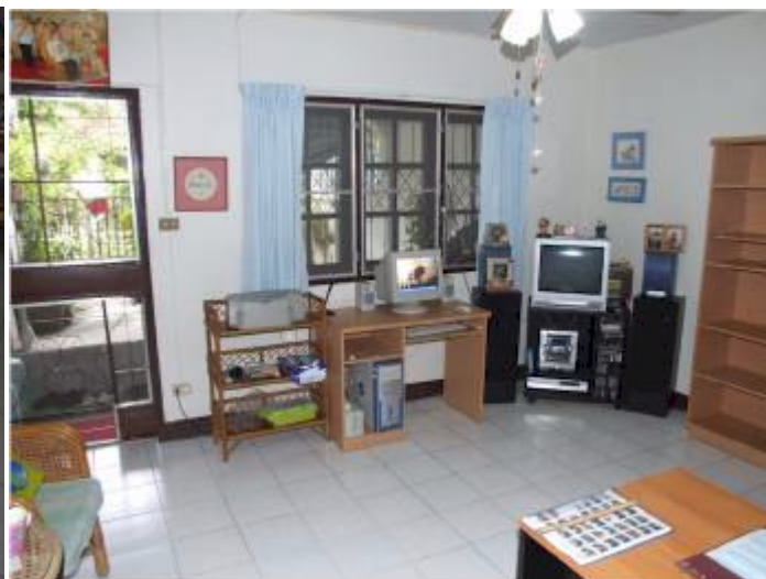
During our visit a new office were established in the AIDS Care house in Chiang Mai.