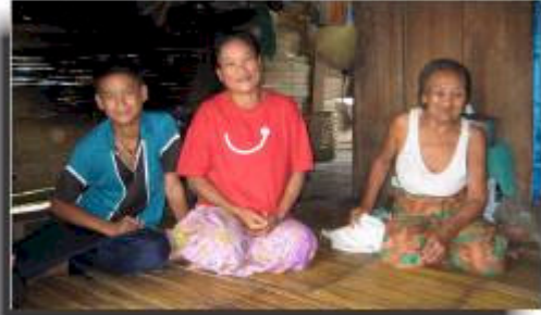
A mother with AIDS together with her son and the grandmother. The husband is working in Bangkok and comes home 1 time a year.