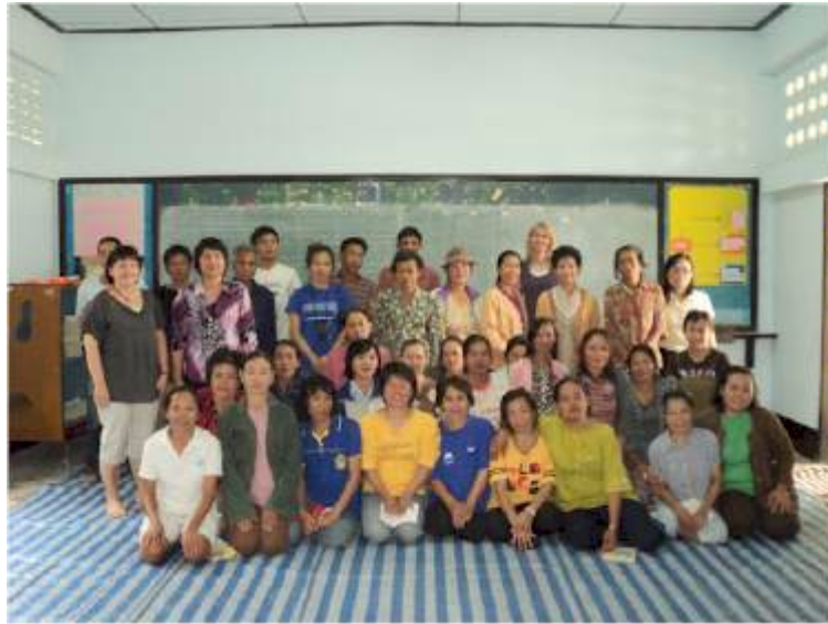
Parents and grandparents, victimized by AIDS, at the seminar

"It is easy to bend a branch while it is still young – but to bend it when it is old is difficult" (An old Thai proverb)