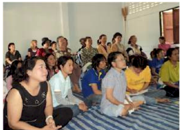
Participants at the seminar listening