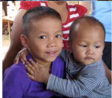
Two boys who are very fond of each other!

But since Toi is neither related to Gawk nor responsible for him, her journey was in vain.