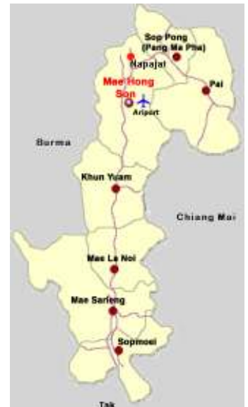
The Mae Hong Son province

In 2010 AIDS Care Mae Hong Son plans to support more children victimized by AIDS and raise the number of children supported from 25 to 40. Therefore the number of local volunteers will increase from one to four.